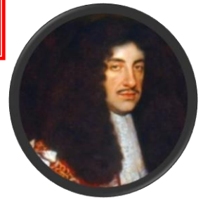
King Charles II